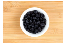
Blueberries ... And more